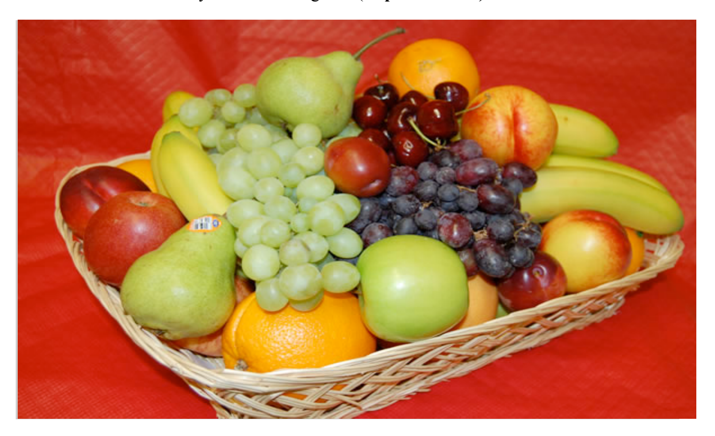
What are the characteristics of a person following the example set by Yahshua Messiah? How can you know you are a real believer?

A look of dismay swept over the waitresses' faces as the family with several children entered the busy restaurant and waited to be seated. Families with children always created problems for them. One of the young women rolled her eyes heavenward, shrugged her shoulders, took out her order pad and escorted the group to the largest table. It was obvious she expected the worst: squabbling, noise, crying and food and silverware scattered on the floor around the table.